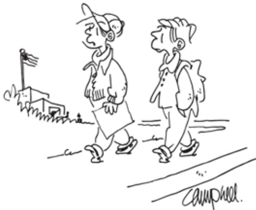
"I made a New Year's resolution to eat broccoli. If I can't stand it, I'll give it up for Lent."

The 50/50 class appreciates you all so much. We have found items in small pop top cans, hygiene items such as small tubes of tooth past, tooth brushes and bath soap move fast. Dish and laundry detergent are taken soon. Small cans of pork and beans, green beans, corn, peas and various fruits in pop top cans are rapid moving items. We have seen folk with back packs who are walking or hitch hiking on the highway stop to see if they can use items for sustenance. Dry beans, rice, spaghetti and items that need cooking do not move. We have to take them to the Food Bank. There may be folks who don't know how to prepare them or do not have a stove. Thanks again for your help! Questions: Ed Boots 620-388-3480.